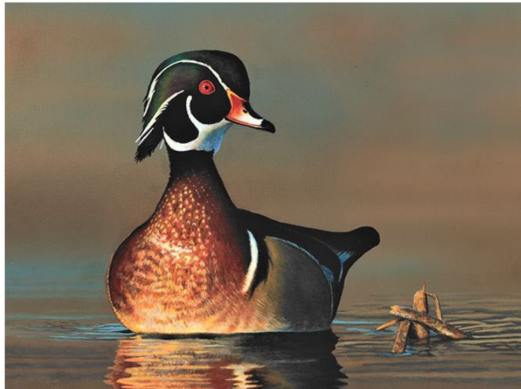
South Dakota Junior Duck Stamp Conservation and Design Program 2020 Best of Show by Madison Grimm