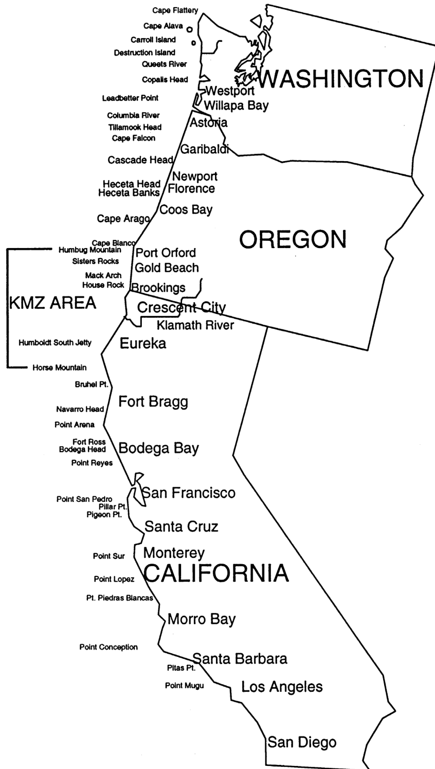
Figure 5. Ocean salmon fisheries management landmarks.