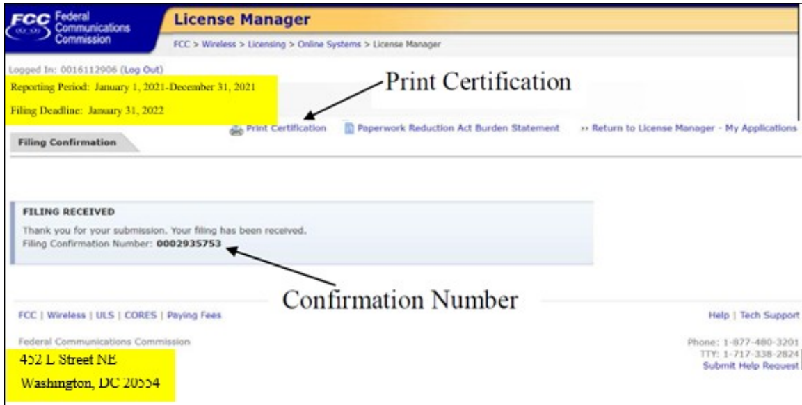
Figure 12 Confirmation Page