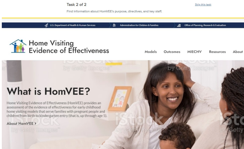
Exhibit 3. Example of first click testing interface

First click tests are used to test web page designs to ensure important page elements are easy to locate and interpret. Participants will be given a task and shown a clickable image of a web page and asked what they would click on first to complete the task (see Exhibit 3). This part of the test will focus on the HomVEE home and model search pages.