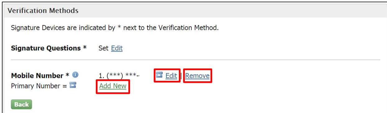
Figure 6: MyCDX Verification Methods

10. Once you have verified your account, select the ‘Sign’ button that appears on the eSignature Widget (see Figure 7).