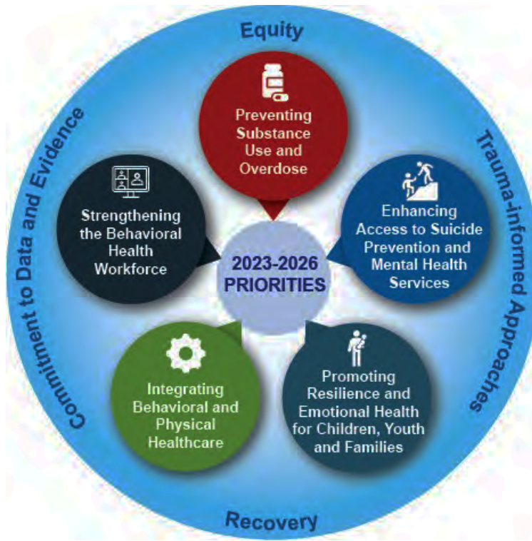
Figure 1. Strategic Plan Priorities and Guiding Principles