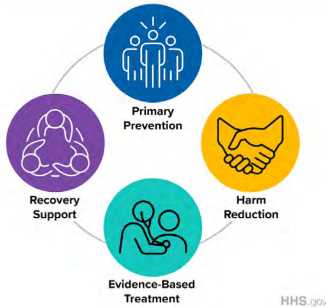
Figure 2. HHS Overdose Prevention Strategy Substance Use Continuum

Primary prevention focuses on intervening before a disease or condition occurs. High-value benefits derived from primary prevention span multiple sectors, including health care, public safety, the criminal justice system, and beyond—both broadly speaking and within marginalized communities. Working to prevent higher-risk behaviors and disease from happening in the first place has many benefits, including financial benefits, prevention of unnecessary human suffering, and reduced negative societal impacts. 26,27 Estimates