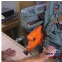
Jobs for Veterans' State Grants