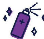
Additional sanitizing requirements