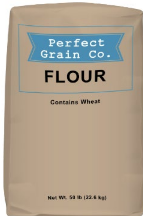
Figure 2. Example of a single-ingredient food intended for further manufacturing where the “Contains” statement is on the front of the food package.

Yes. Single-ingredient foods must comply with the food allergen labeling requirements in section 403(w)(1) of the FD&C Act. A single-ingredient food that is, or contains, protein derived from milk, egg, fish, Crustacean shellfish, tree nuts, wheat, peanuts, sesame, or soybeans may identify the food source from which the major food allergen is derived in the statement of identity (or name of food), e.g., “All-purpose wheat flour,” or use the “Contains” statement format. Because a single-ingredient food does not require an ingredient list, FDA recommends that if a “Contains” statement format is used for a retail package, the statement be placed immediately above the manufacturer, packer, or distributor statement. For single-ingredient foods intended for further manufacturing where the “Contains” statement format is used, we recommend that the “Contains” statement be placed on the front of the package of the food near the statement of identity. See Figure 5.