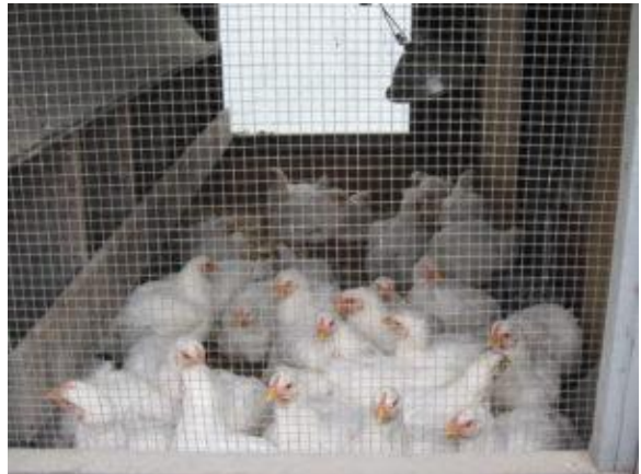
Young chickens in a wood and wire coop.

Sweep or blow dust and other loose dirt off ceilings, light fixtures, walls, cages or nest boxes, fans, air inlets etc. onto the floor. Remove all feed from feeders. Scrape manure and accumulated dust and dirt from perches and roosts. Remove all litter from the floor. Litter can be added to a compost pile. Sweep the floor to remove as much dry material as possible. With a small coop, a wet-dry shop vacuum does a good job of removing this material. However, be careful to clean the filter often as the fine dust from the coop may easily clog the filter and make the vacuum work harder or lead to burn out of the motor.