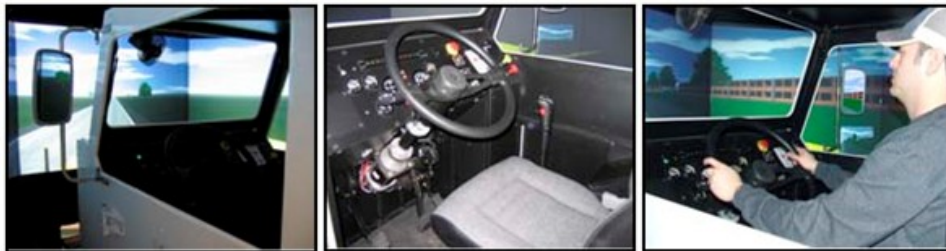
Figure 1. VTTI's CTAPS

The CTAPS (Figure 1; FAAC model TT-2000-V7) is a full-mission driver- and/or hardware-in-the-loop simulation tool. CTAPS allows VTTI to simulate multiple commercial vehicle types, including dump trucks and tractor-trailers with various trailer types, lengths, and load configurations. VTTI can produce interactive and programmable traffic and roadway environments (e.g., snow, rain, construction zones, and different levels of traffic densities), trigger vehicle malfunctions (e.g., front tire blowout and air pressure loss), and develop custom SCEs. CTAPS provides a 225-degree forward field of view along with two rear video channels that can be viewed through real west coast mirrors installed on the truck cab. CTAPS can also display an overhead (birds-eye) view of the training or scenario. All simulator hardware has been updated to current high-performance standards as of early 2021.