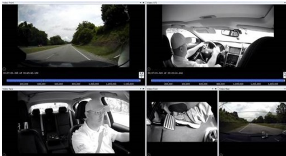
Figure 3. Example of High-quality Video from FlexDAS

The FlexDAS can collect, encode, and encrypt eight 1080p high-definition video streams (see Figure 3 for example photos of demonstrating the FlexDAS' video quality). For this study, the FlexDAS will be integrated to collect data from the forward roadway simulation, the left- and right-side simulations, a driver facing camera, an over-the-shoulder camera, a remote operator facing camera (when appropriate), and a remote operator over-the-shoulder camera (when appropriate). The encrypted data are stored on a removable solid-state drive within the FlexDAS.