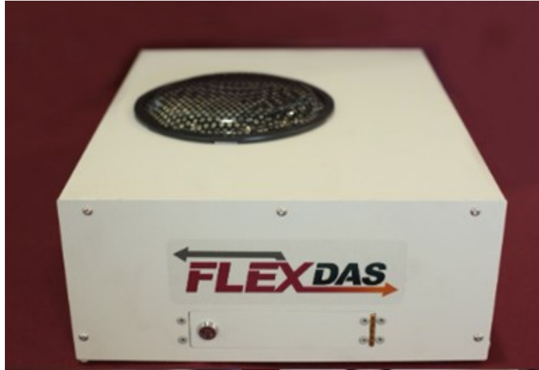
Figure 2. VTTI's FlexDAS

The FlexDAS can collect, encode, and encrypt eight 1080p high-definition video streams (see Figure 3 for example photos of demonstrating the FlexDAS' video quality). For this study, the FlexDAS will be integrated to collect data from the forward roadway simulation, the left- and right-side simulations, a driver facing camera, an over-the-shoulder camera, a remote operator facing camera (when appropriate), and a remote operator over-the-shoulder camera (when appropriate). The encrypted data are stored on a removable solid-state drive within the FlexDAS.