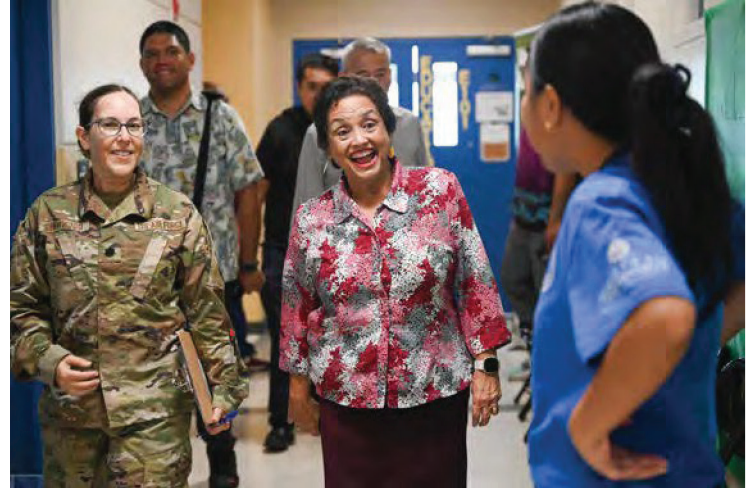
Guam Gov. Lou Leon Guerrero tours the 2024 Guam Wellness Innovative Readiness Training pop-up clinic.