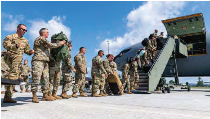
Vermont Air National Guard Airmen return home from a Girl Scouts of Hawaii Innovation Readiness Training mission.