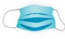
B. Disposable surgical mask