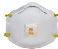
D. N95 disposable