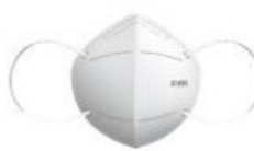
C. KN95 mask