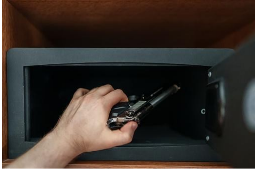
Photos of a gun safe/lock box with multiple guns inside