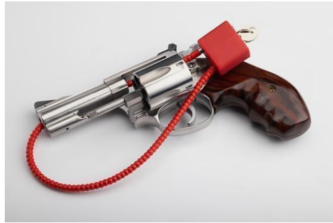
Photos of a gun safe/lock box