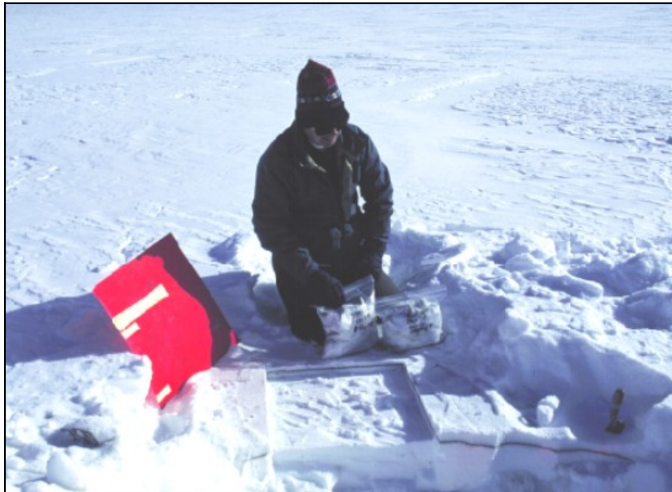
Figure 1. Collection of measured-area ash samples from snow pack after the 1992 eruption of Crater Peak/ Mount Spurr, AK (photo taken on 9/24/92).

If ash fall is unexpected - no snow, no container,