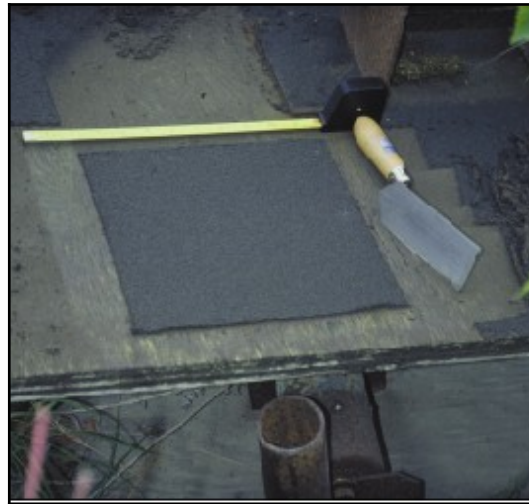
Figure 2. Collection of measured-area tephra samples from hard surfaces after 1992 eruption of Crater Peak/Mount Spurr, AK (photo from 9/21/92).